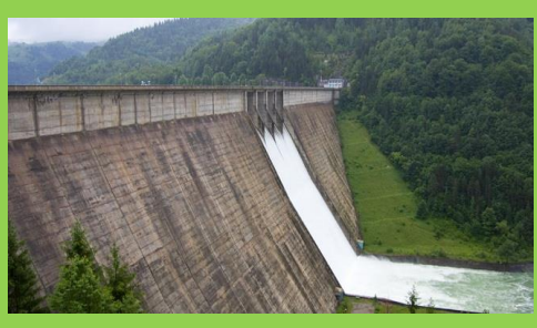
Hydropower Plant Bicaz