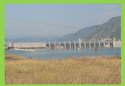
Hydropower Plant Porțile de Fier I